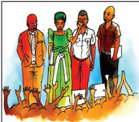
Women participation in leadership is critical.