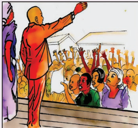
Leaders should stand out as role models to the community.